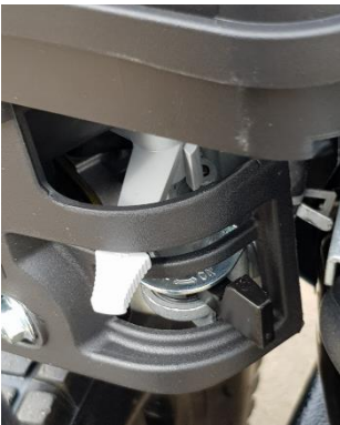
Fig4: Engine Fuel tap lever (black) and choke lever (grey)

The image shows the high-pressure hose disconnected and a jet of water jetting out. This is normally done when priming (getting the air out and water in) the pump when the machine is used on suction. Run the engine until you get a strong stream of water jetting out, then stop the engine and connect the high-pressure hose, then restart with the pressure adjustment knob set on low pressure.