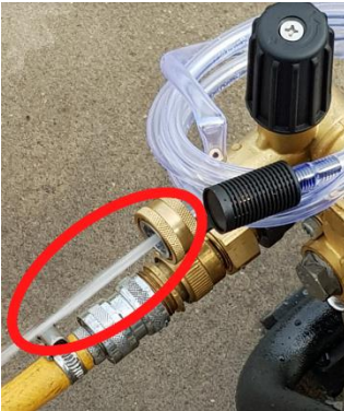
Fig3: High pressure outlet: This is where the high-pressure hose connects.

When the engine has started turn the pressure adjuster clockwise to increase pressure to suite the task you are undertaking.