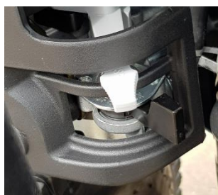
Fig5: Warm start or trouble start position - Engine Fuel tap lever (black) to the right and choke lever (grey) in centre position. Don't forget to move this choke lever immediately to the right (off position) when the engine starts running

The figure shown is the starting position before pulling the pull cord when the engine is cold. Black lever to the right (on position) – this stays in this position throughout the operation ; Grey lever to the left (on position) – this choke lever is moved immediately to the right (off position) when the engine starts running.