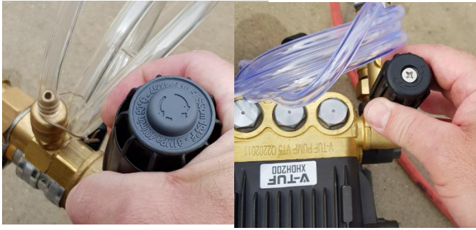
Fig2: Pressure adjustment knob (these may differ in looks) – turn anticlockwise (to low pressure) for starting. This will make it easier to start and also reduce unnecessary wear on your engine pull start mechanism.

When the engine has started turn the pressure adjuster clockwise to increase pressure to suite the task you are undertaking.